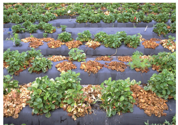
Plant mortality due to charcoal rot